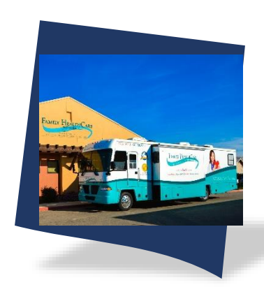
Mobile Health 12 Locations